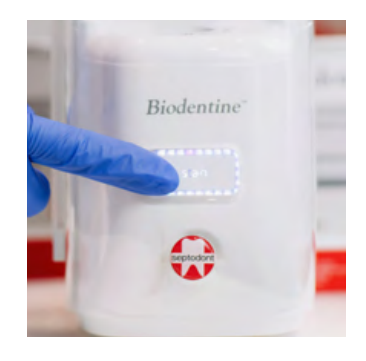
Activate by pushing the lever